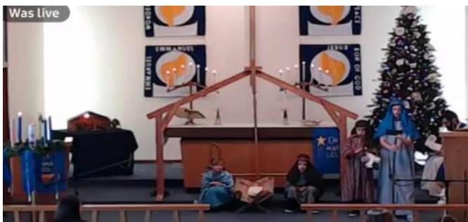
Portraying the Nativity