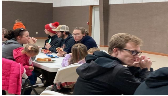
Parents may have had to encourage children to eat prior to the hayride