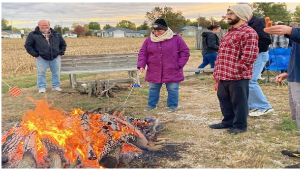
The bonfire was a popular spot for cooking and warmth.