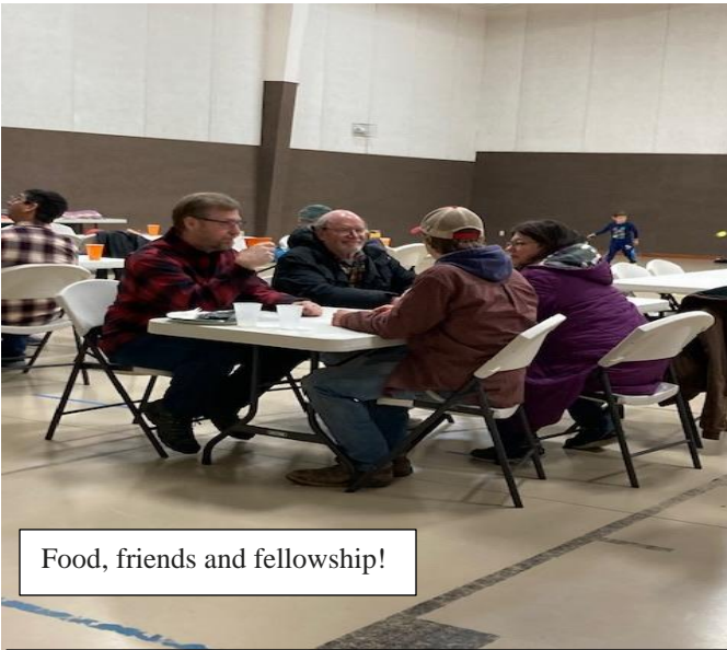
Food, friends and fellowship!

The Shared Ministry of Campus and Good Shepherd co-hosted a bonfire/hot dog cook-out and hayride on Sunday, October 15 th . Approximately 90 people attended with members of both congregations and college students. Approximately 144 hot dogs were cooked and most of these consumed. Both indoor and outdoor games were enjoyed along with fellowship, relationship building, and the hayride. We are continually looking for servant events to participate in, as well as ways to further build relationships between members of the two congregations. Many thanks to all who assisted in making this a successful event.