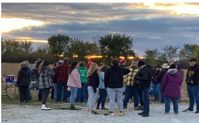
God blessed us with a beautiful sunset!