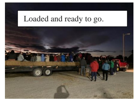
Loaded and ready to go.