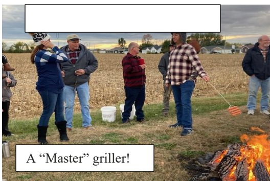
A "Master" griller!